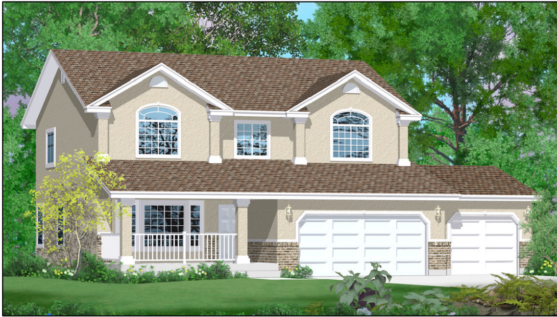
Optional 3rd Car Garage Shown